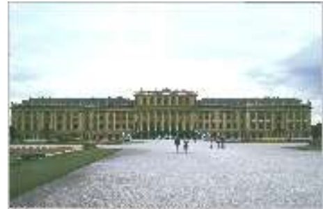
VIENNA: THE PALACE OF SCHONBRUNN