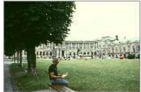
VIENNA: THE HOFBURG PALACE

An armchair tour of this magnificent city filled with baroque palaces created by imperial and aristocratic privilege. We take a drive around the magnificent Ringstrasse, the wide boulevard which encircles the centre and see memorials to Mozart and Strauss in a city that was the home of Haydn, Mozart, Beethoven, Schubert, Brahms and Mahler. We visit the Hofburg, the great winter palace of the Hapsburg dynasty, Schonbrunn, the summer palace of Maria Theresa. Decades later this was where Napoleon installed himself before the Battle of Austerlitz and was given the Austrian Emperor's daughter, Marie Louise as a wife to bear him a son who died here. We see the great watercolours of Durer and drawings by Rubens in the Albertina Museum, visit the Kunsthistorisches Museum, one of the worlds' great art collections with its treasures collected by the Hapsburgs including some of the finest works by Breughel, Rubens and Velasquez. We enjoy the sensuous art of Gustav Klimpt at the great Schloss Belvedere built to celebrate the saving of the city from the Turks and at the newly restored gold-domed Secession building, built in 1898 to exhibit avant garde art.