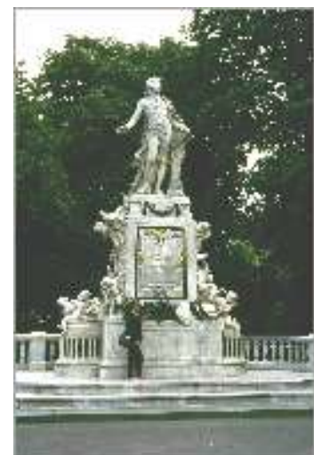
VIENNA: THE MOZART MEMORIAL